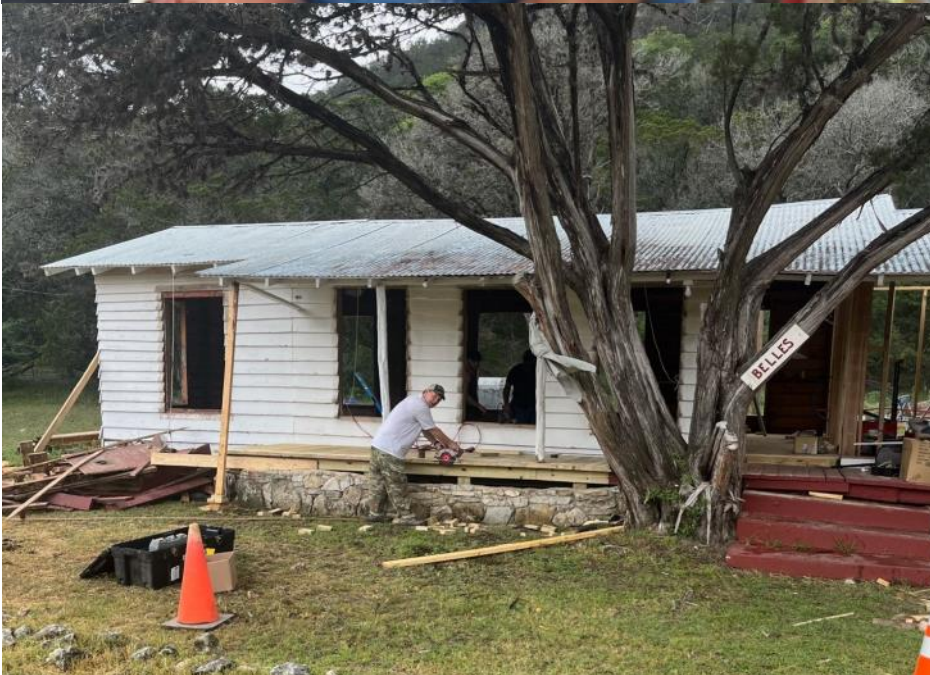
Pictured left - Steve Damon in action on bunkhouse makeover