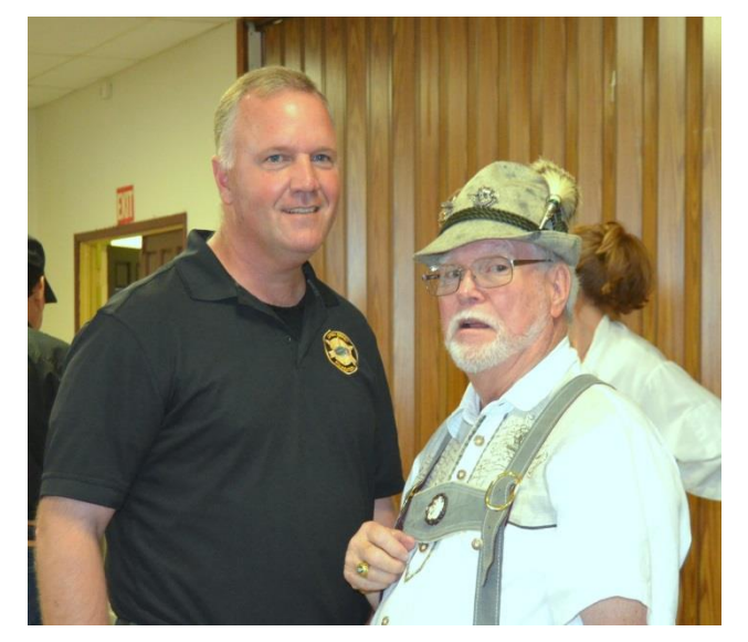
<u>Dick's Last Resort</u> <u>fundraiser pictures will be</u> <u>sent out next week in a</u> <u>special edition as soon as</u>