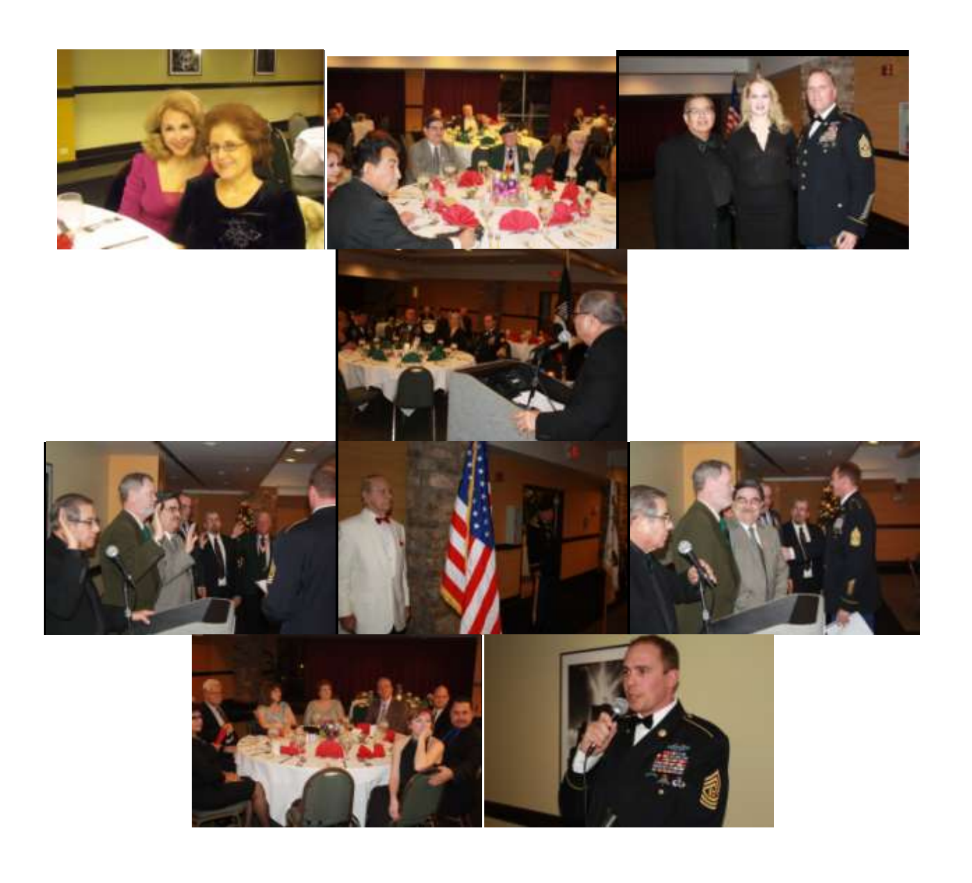
The El Tropicano served a terrific meal and the service was excellent and the all female mariachi group was outstanding.