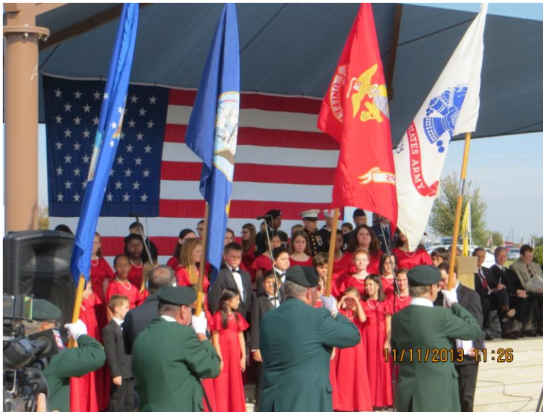
SFA Ch. XV presenting the colors in front of the Texas Childrens choir at Ft. Sam Houston Natl. Cemetery on Veterans Day 2013. SFA Ch. XV made a significant donation to the Choir for them to make their trip to France to sing at the USA Cemetery in Normandy.