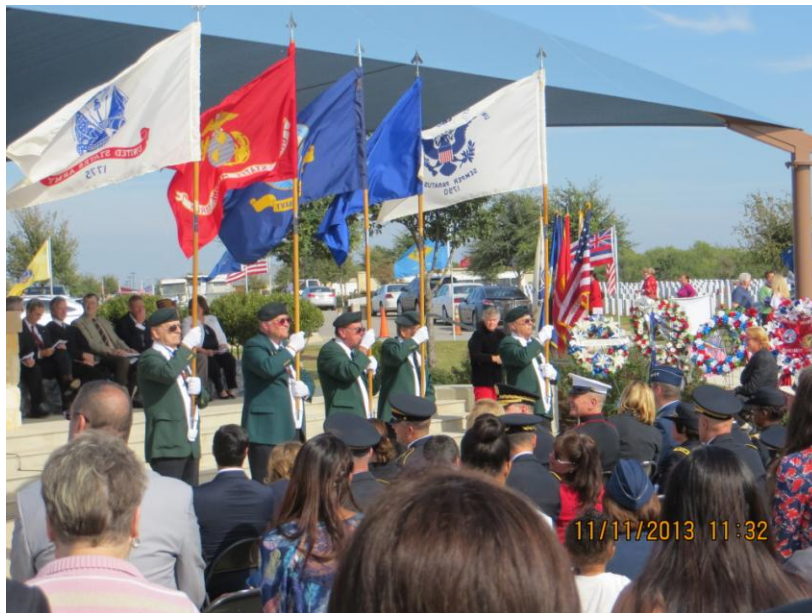
SFA Ch. XV members presenting the colors at the Veterans Day Ceremonies at Fort Sam Houston, Texas National Cemetery.