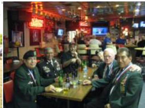
The Honor Guard relaxing afterwards.