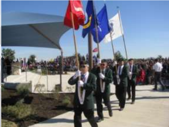
SFA Chapter XV Honor Guard.