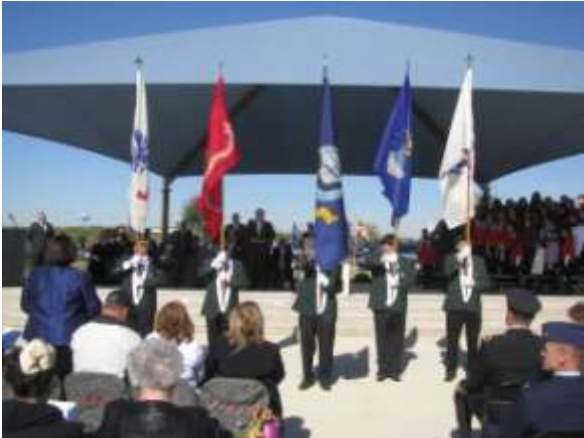
SFA Chapter XV Honor Guard.