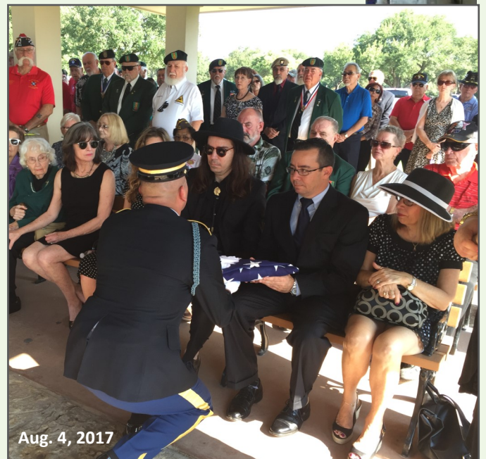
Aug. 4, 2017