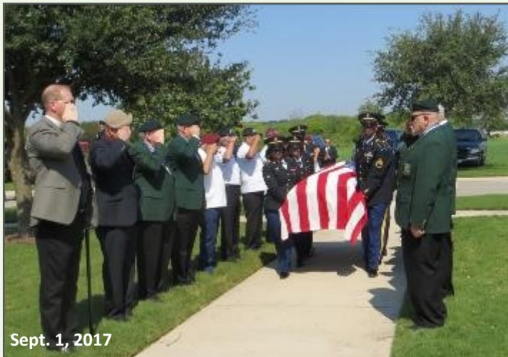
Sept. 1, 2017