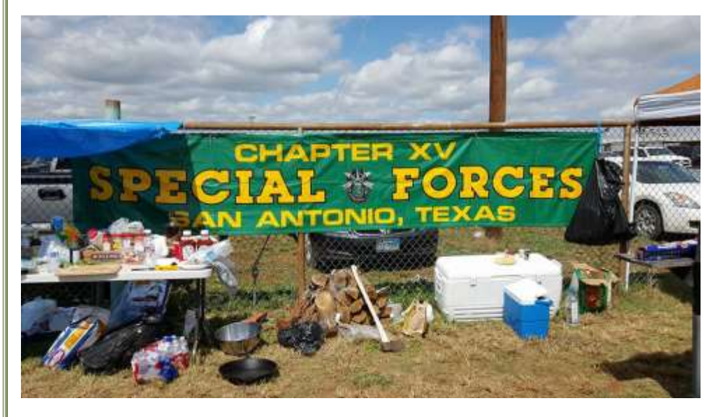
Chapter XV was organized and well prepared for a great weekend.