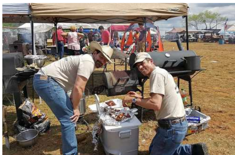
OK, let me see, what the rules say