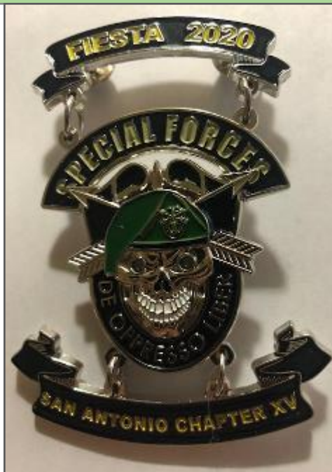
Fiesta medal with lights off