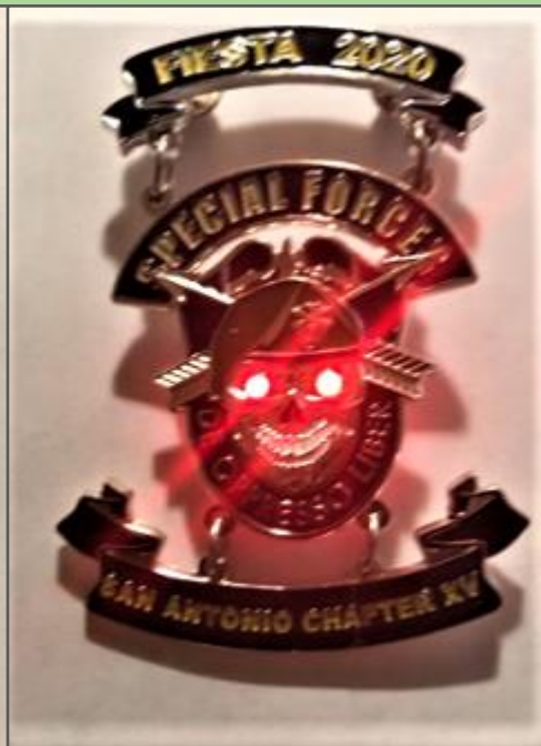
Medal with lighted red eyes