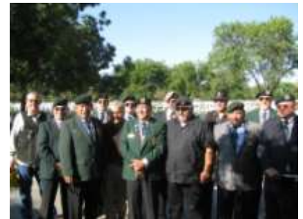
Group picture of Alamo Chapter members in attendance.