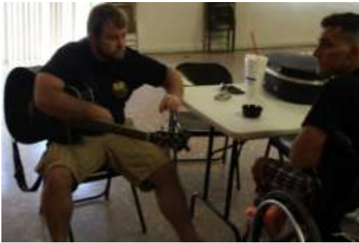
Two of our guests enjoy the music after eating a fantastic meal.