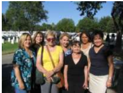
Ladies of SFA Chapter XV.