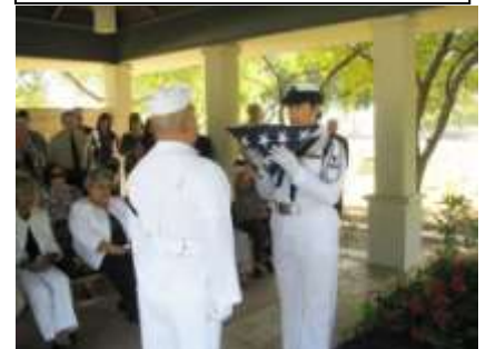
Folding the flag for presentation to the family.