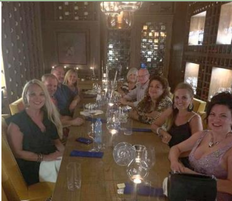
Wine cellar dinner for the gang from Chapter XV