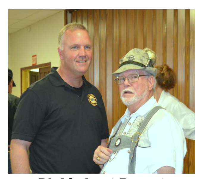
Dick's Last Resort fundraiser pictures will be sent out next week in a special edition as soon as we work out our computer problems. Thank you. The Editor